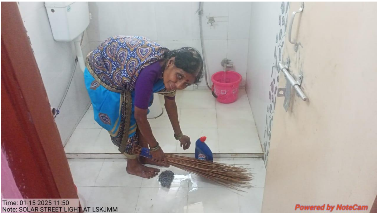
Time: 01-15-2025 11:50 Note: SOLAR STREET LIGHT AT LSKJMM