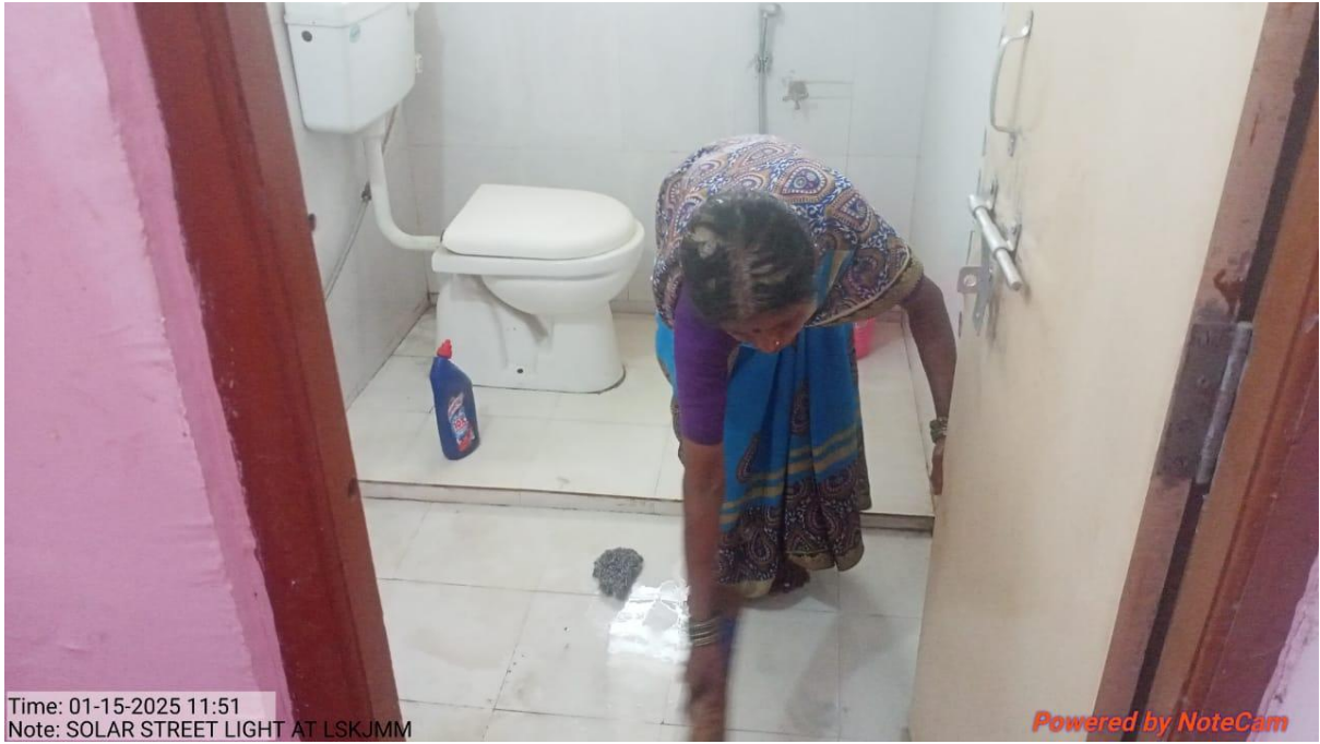
Time: 01-15-2025 11:51 Note: SOLAR STREET LIGHT AT LSKJMM