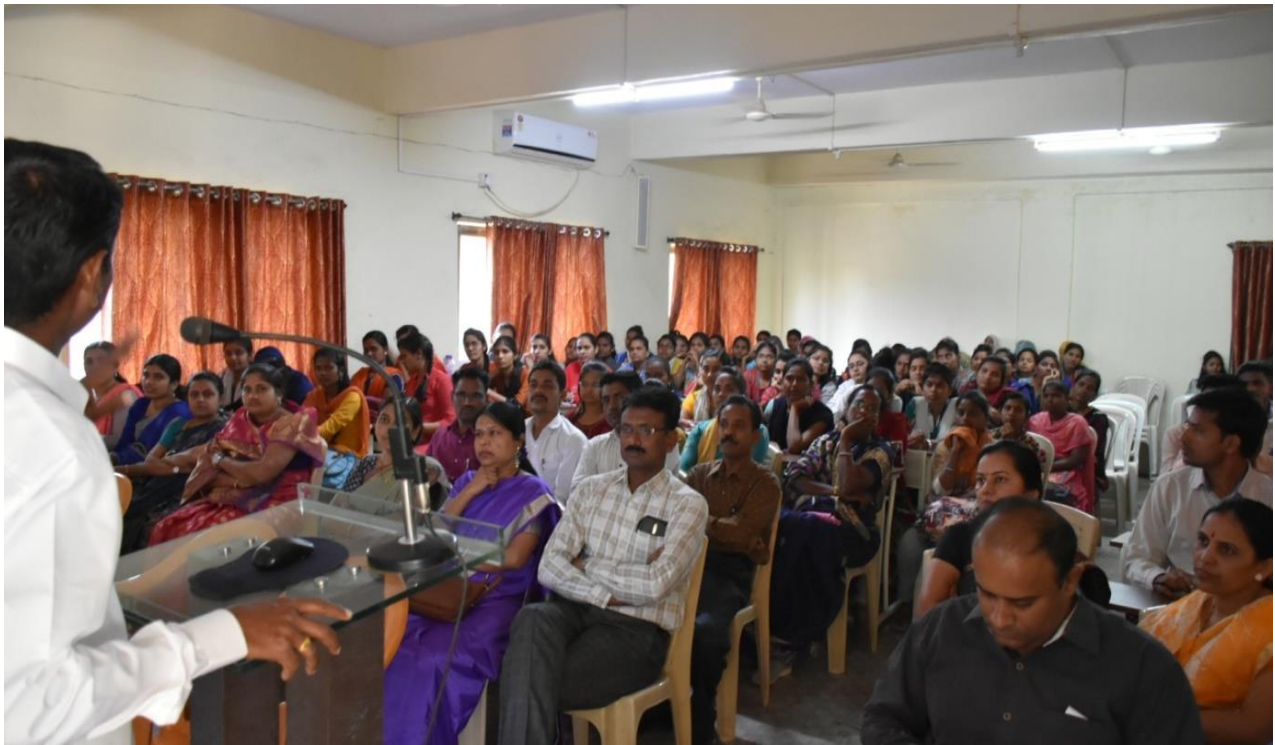
One Day Regional Level Workshop on ‘Research Methodology ‘ Jointly Organized with IQAC Dated: 05.03.2020, Beneficiary- 215