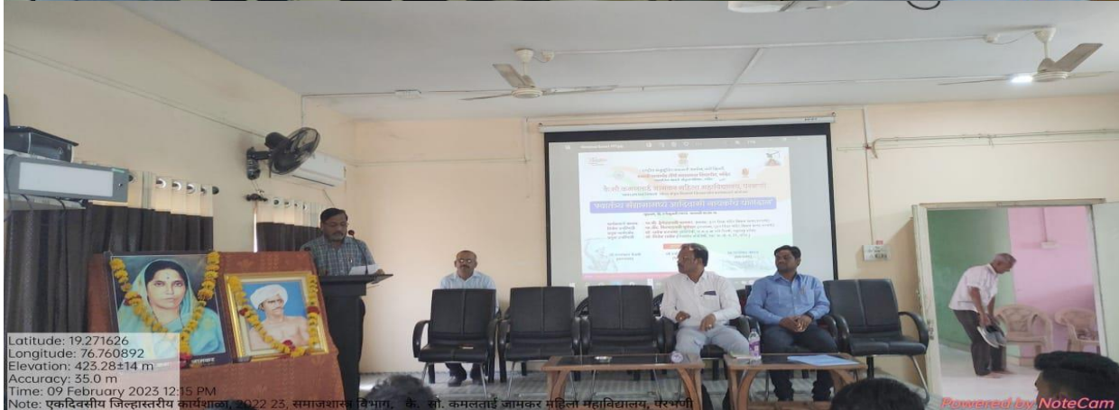
One Day District Level Workshop & Framework Exhibition on ‘Contribution of Tribal Heroes in Freedom fight’ Jointly Organized with National Commission for Scheduled Tribes, Delhi & SRTMU, Nanded Dated: 09.02.2023, Beneficiary- 92.