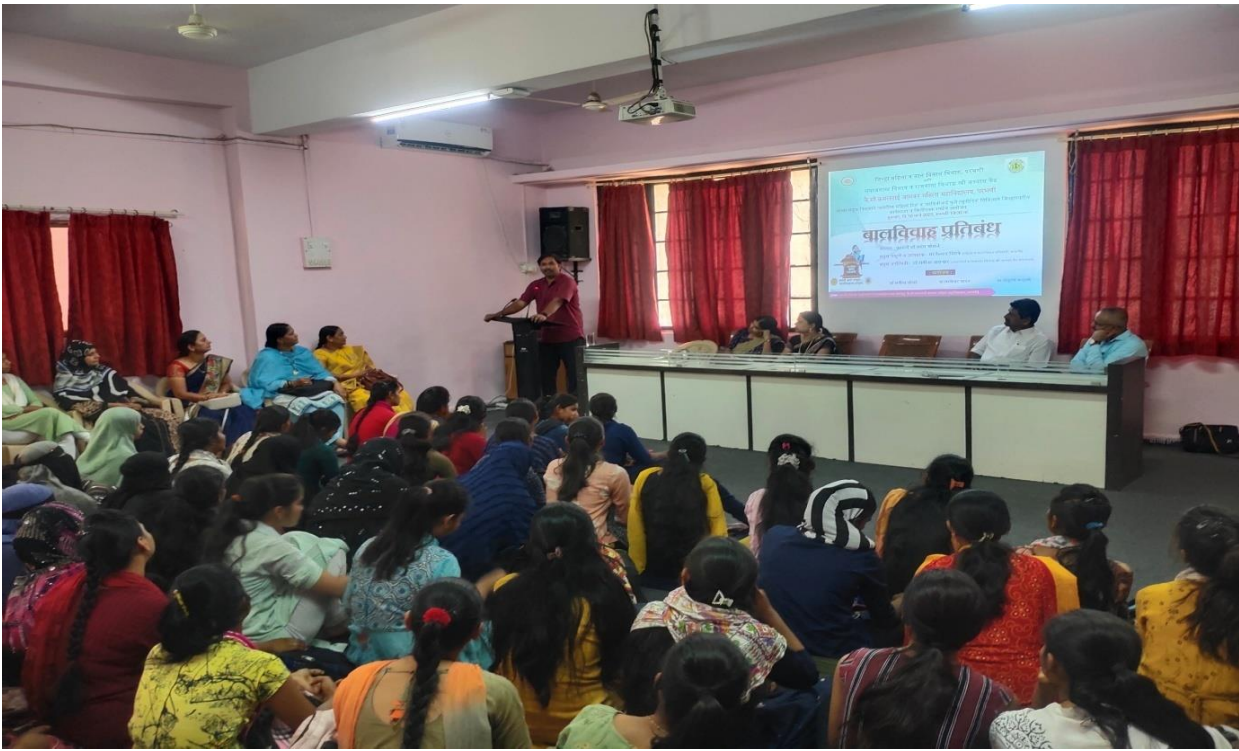
One Day College Level Workshop & Poster Competition on ‘Prevention of Child Marriage’ Jointly Organized with District Women and Child Development Department, Parbhani Dated: 10.03.2023, Beneficiary-72