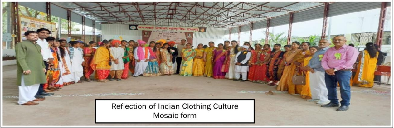
Reflection of Indian Clothing Culture Mosaic form