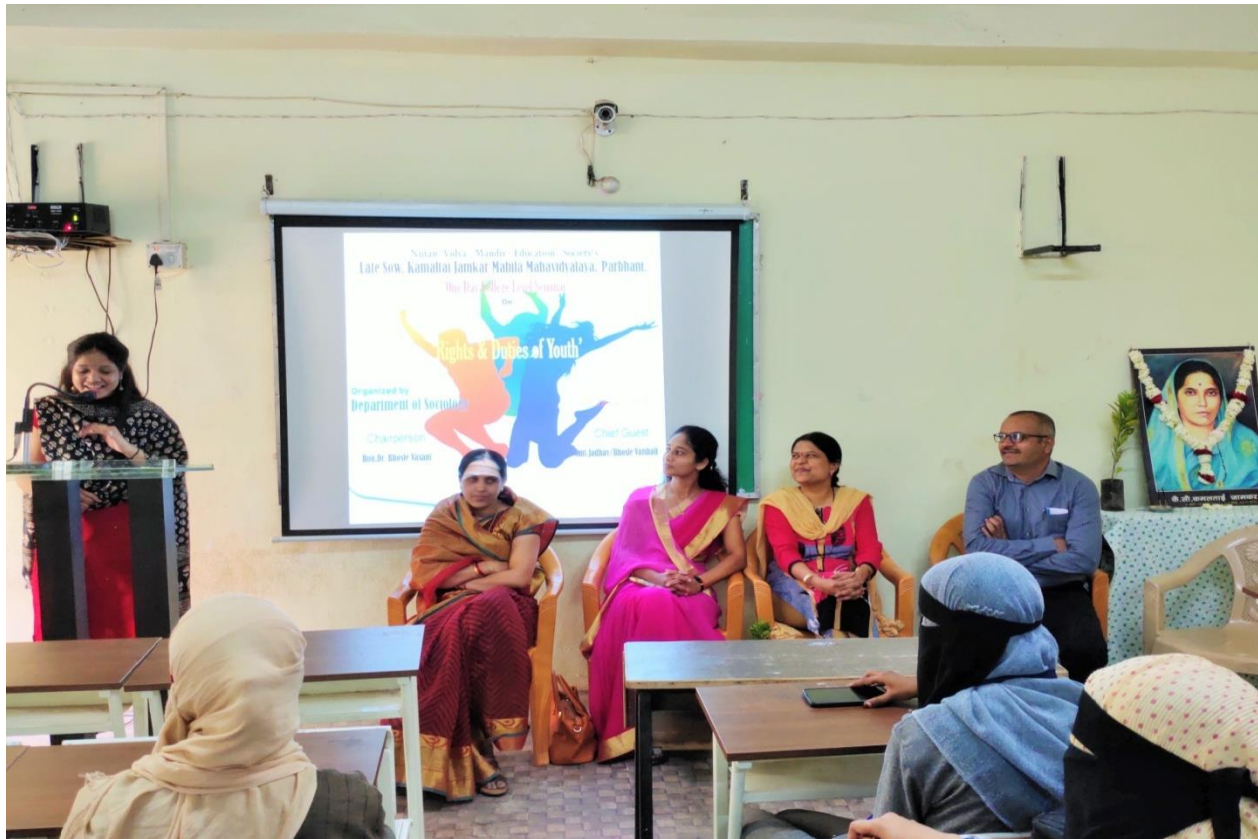
One Day Institutional Level Seminar on ‘Rights and Duties of Youth’ Dated: 06.02.2021, Dated:06.02.2021, Beneficiary- 94