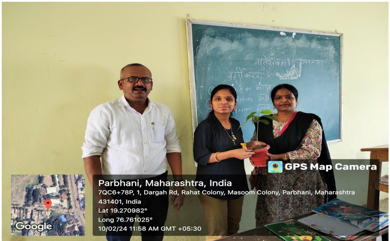
Regular Activities Conducted by Department- 'One Student One Tree' A Tree Adoption Initiative- 2019-20 to 2023-24