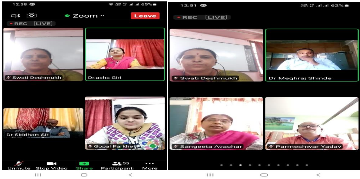
One Day National Level Webinar on ‘Contribution of Social Reformers in Modern Maharashtra Reformation’ Jointly Organized with Department of History Dated: 26.06.2021, Beneficiary- 350