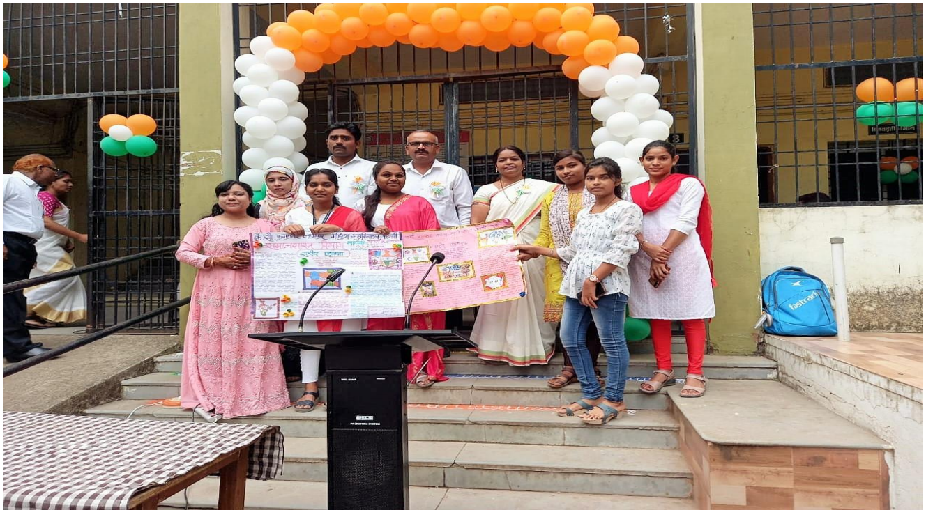
Regular Activities Conducted by Department -Wall Papers Released- 2018-19 to 2023-24