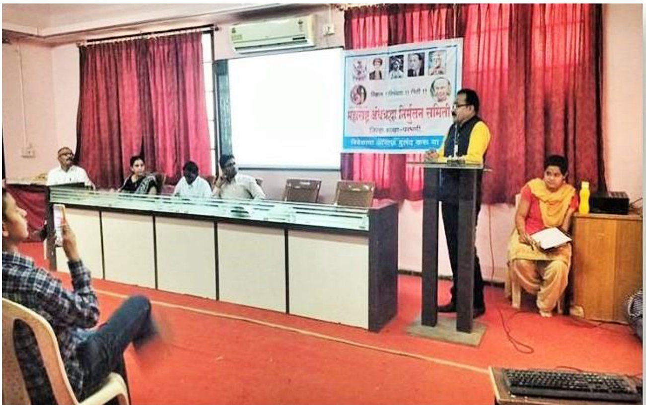
Institutional Level Workshop on The ‘Necessity of Eradicating Superstitions for Women Empowerment’ , Dated: 11.02.2019, Beneficiary-42