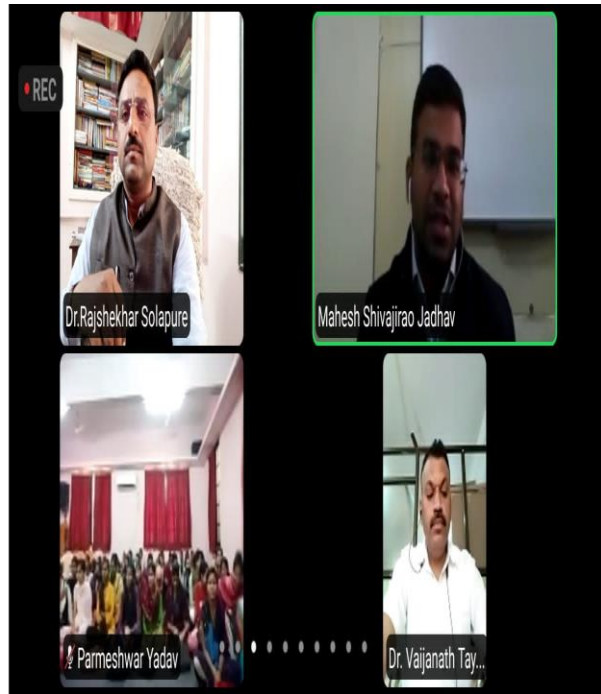
State Level Webinar on ‘Human Rights & Students Responsibility ‘ Jointly Organized with Department of History Dated: 10.12.2021, Beneficiary- 140