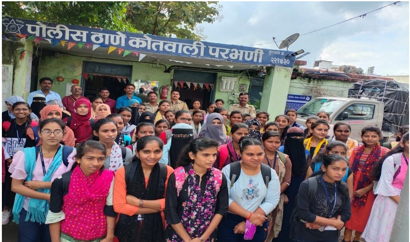
Visit to Kotwali Police Station, Parbhani, to Know about the 'Role and Functioning of Police Administration' Dated: 12.10.2022, Beneficiary-52