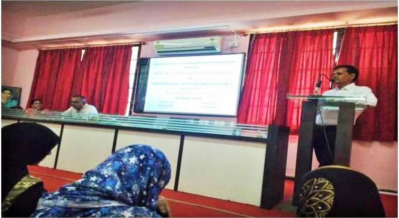
Institution Level Seminar on ‘Social Issues in Contemporary India ‘ Dated: 25.09.2018, Beneficiary- 80