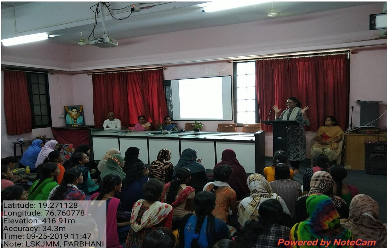
'Establishment of Sociology Association and Organizing Counseling Session' , Dated: 25.09.2019, Beneficiary-54