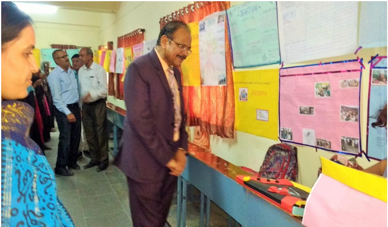
Institution Level Poster Presentation Competition on 'Human Rights' Date: 14.02.2019, Beneficiary-41