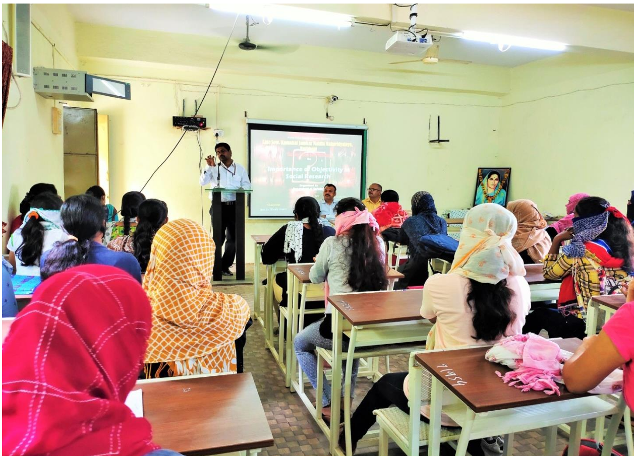
One Day Institutional Level Workshop on ‘Research Methodology’ Dated:02.12.2020, Beneficiary- 39