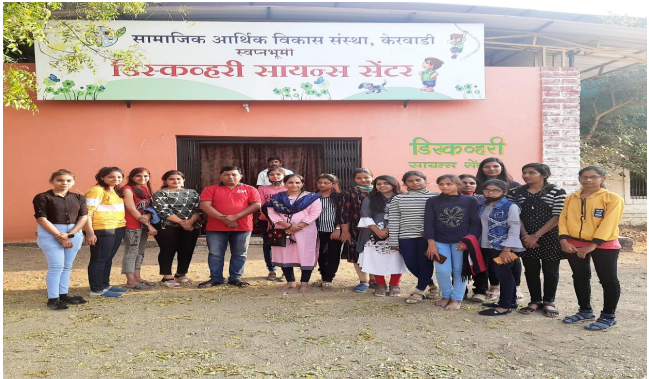
Visit to Socio Economic Development Trust(International NGO) Swapnbhumi, Kerwadi, Tal: Palam Dist: Parbhani. & Enriched Biodiversity of Jambhulbet Dated: 14.02.2021, Beneficiary-15