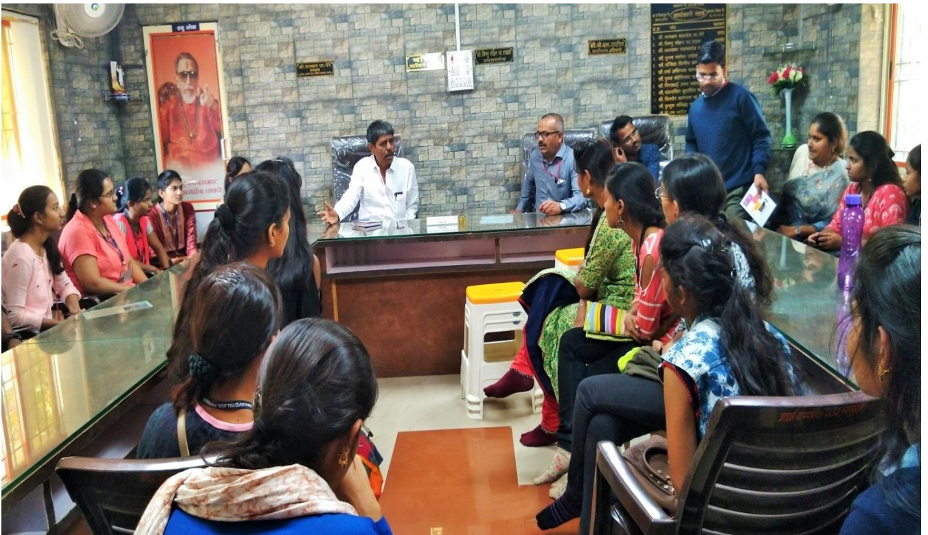
Visit to Ideal (Smart) Village Patoda (Tal.-Dist.Sambhajinagar) and Cultural Heritage Site Ellora Caves and Bibi Ka Maqbara- Dated:16.02.2020 - Beneficiary- 41