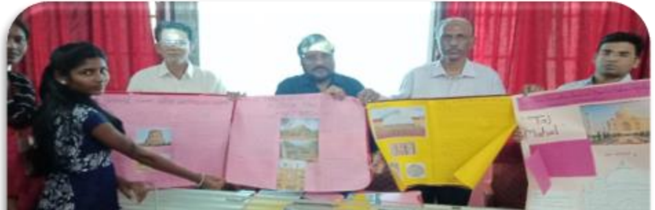
World Tourism Day 28/09/2018