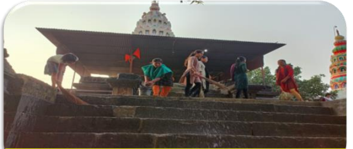
Cleanliness Campaign at Heritage Site Jamb 25/11/2023

Gandhi Vichar Darshan Exam on Martyrs' Day 30/01/2023