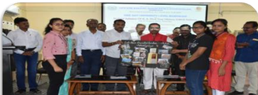
HRIDAY Scheme 01/08/2019