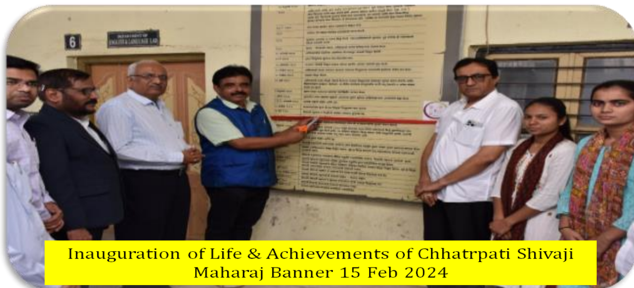
Inauguration of Life & Achievements of Chhatrapati Shivaji Maharaj Banner 15 Feb 2024