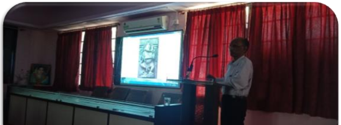
Relation of Tourism and Art & Architecture 28/09/2018