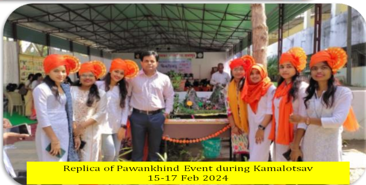
Replica of Pawankhind Event during Kamalotsav 15-17 Feb 2024