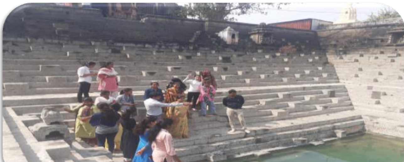
Mahadev Temple, Pingali 28/02/2023