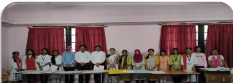
Swami Ramanand Teerth 17/09/2022