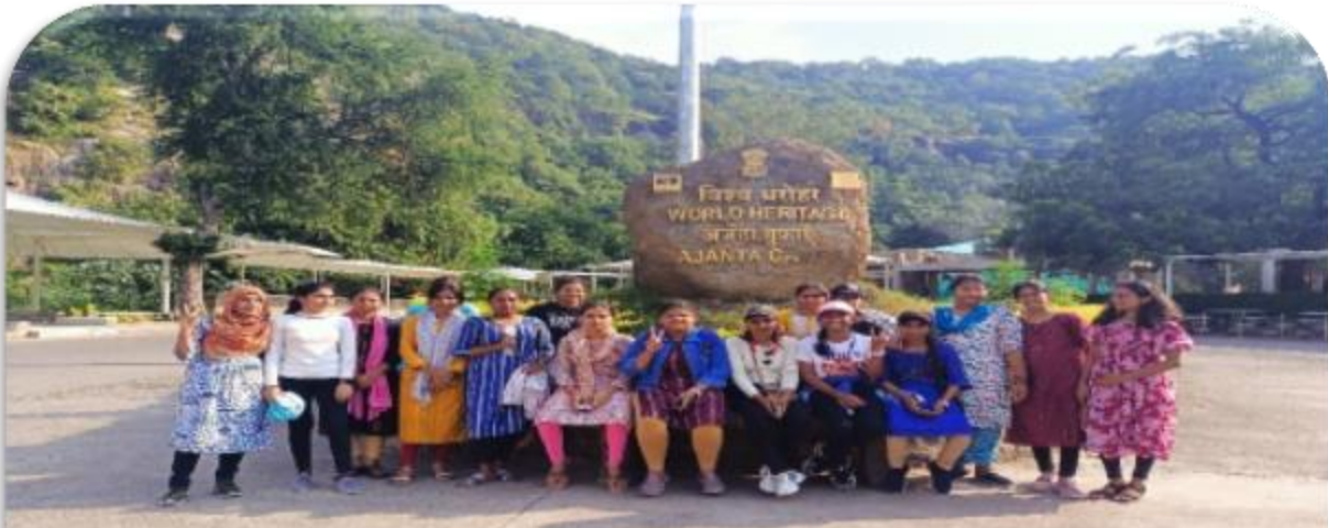
Ajantha Caves, Ajantha 12/10/2023