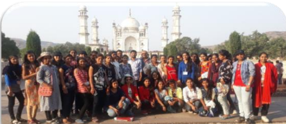
Bibi Ka Makbara, Aurangabad 16/02/2020