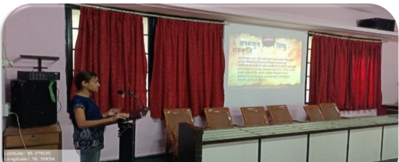
PPT Presentation by Akshata Dahale 19/10/2022