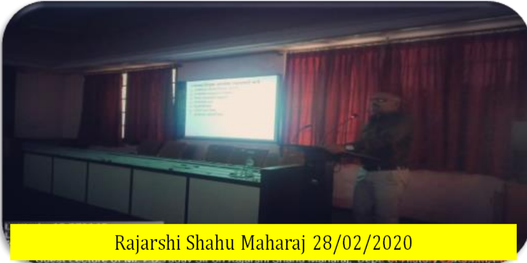
Rajarshi Shahu Maharaj 28/02/2020