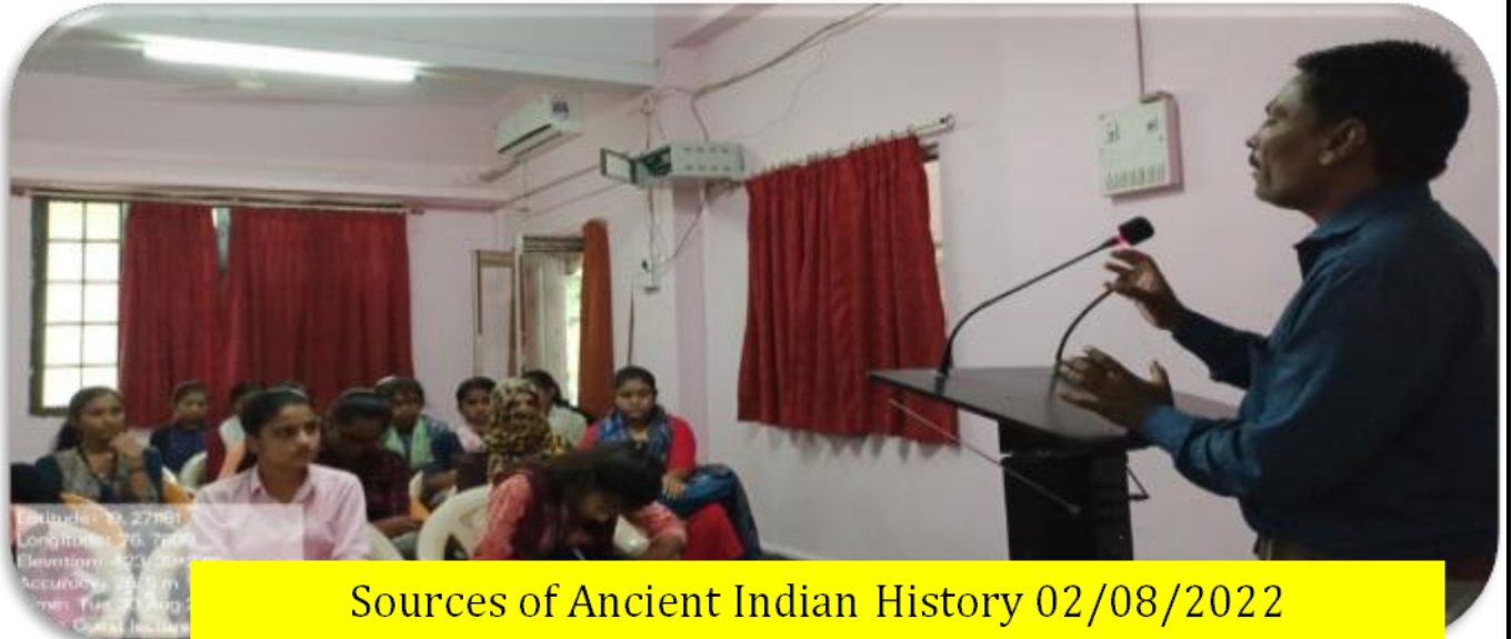
Sources of Ancient Indian History 02/08/2022