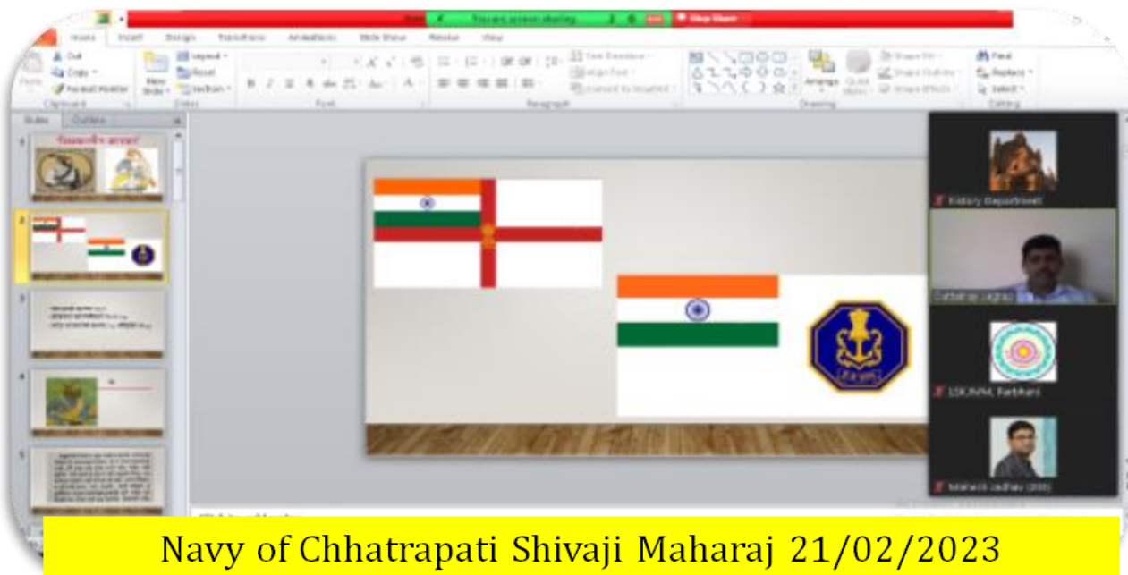
Navy of Chhatrapati Shivaji Maharaj 21/02/2023