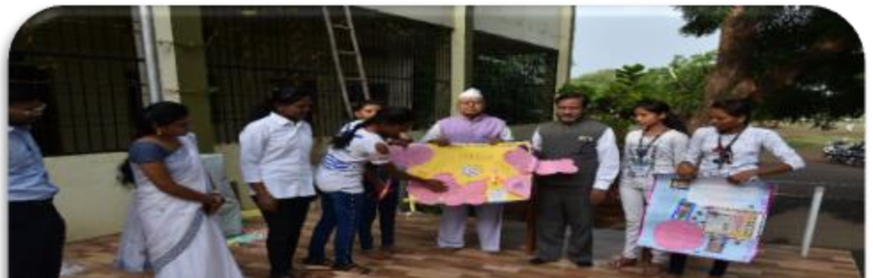
Marathawada Liberation Day 17/09/2020