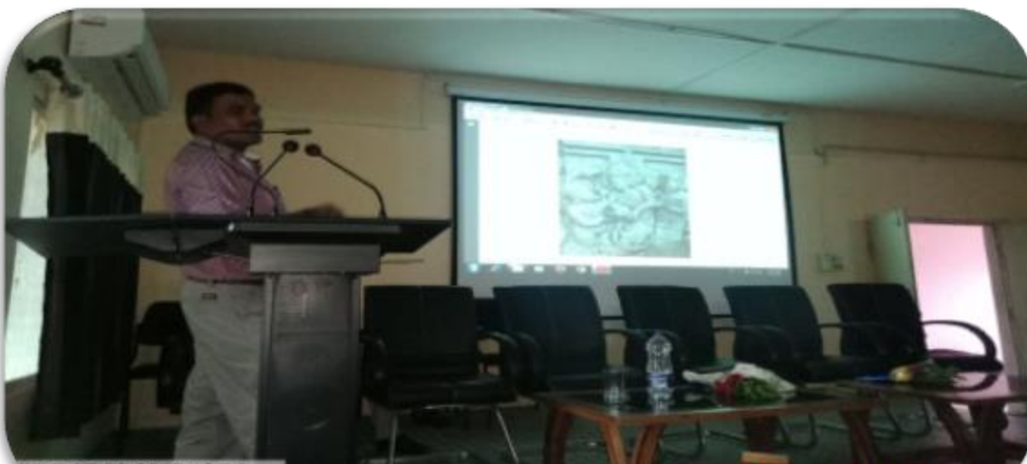
Art & Architecture of Temples in Parbhani 27/09/2019