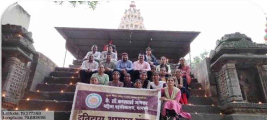
Dipotsav at Heritage Site Jamb 25/11/2023