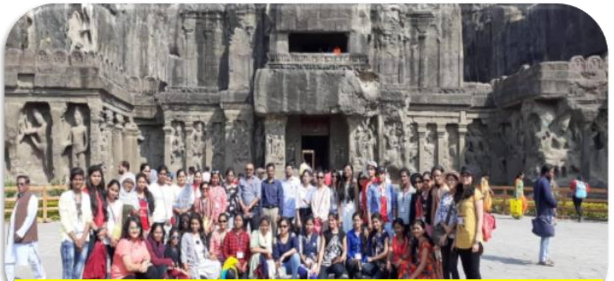
Kailas Temple, Ellora 16/02/2020