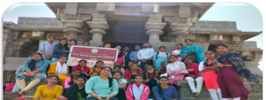
Kedareshwar Temple, Dharmapuri 18/12/2021