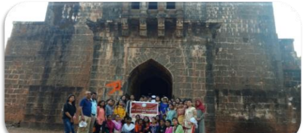
Panhala Fort, Kolhapur 18/02/2019